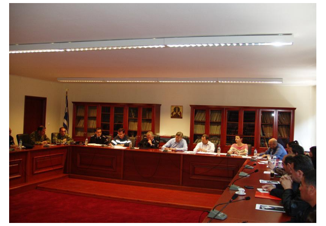
Meeting of the Coordinating Body of the R.U. of Thesprotia

Dividing the year into periods and specifying the necessary actions per period, is an important point in the plan of the General Secretariat of Civil Protection against snowfalls and frost. The year is divided into the three periods mentioned below and each one of them is connected with specific actions that should be implemented: